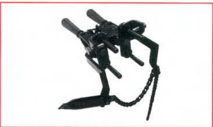
AHCC00-Z OR AHCD00-Z