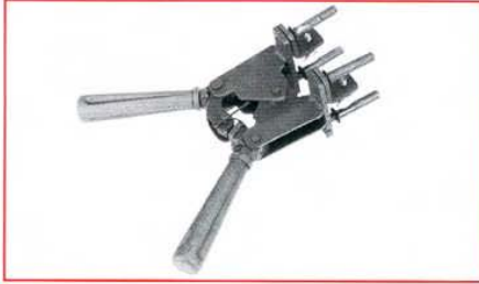
AHCC00 OR AHCD00

ELECTROWELD handle clamp make possible the use of many different size and type of graphite moulds with only two different type.