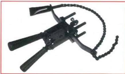
AHCC00-X OR AHCD00-X